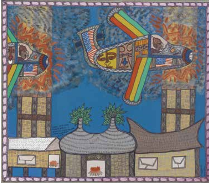
Gende Simon, Plane crash into the Twin Towers on September 11, 2001, 2012 , acrylic on canvas, ART96124